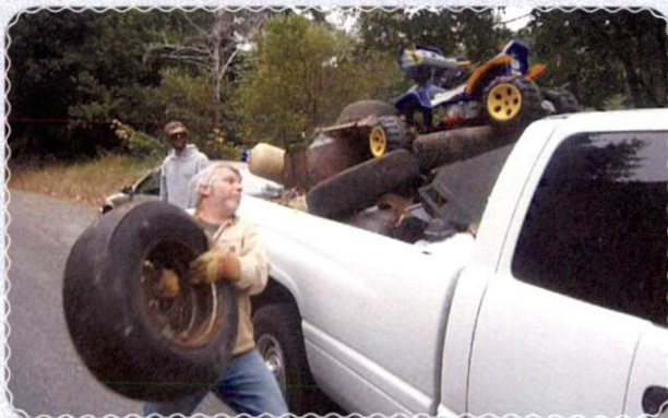
Mad River Alliance members removed over 750 pounds of trash in September, 2012.

Volunteers organize in the Fall, Spring, and Summer to remove trash and other hazardous waste from the banks of the Mad River. Clean-up Dates will be announced in the online quarterly newsletter.