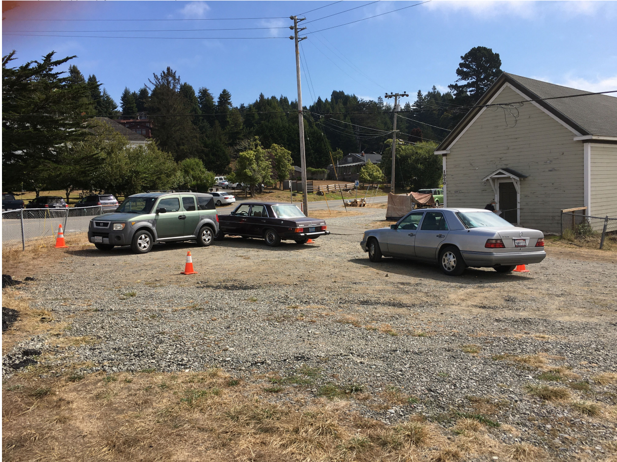
LOGGING TRUCKS are the introduction of Old Forest Rd & Faculty Creek Rd. REGULARLY through the Spring, Summer and Fall seasons to access their timberlands in the Faculty Creek Watershed. This is how these three trucks would access the 1902 Empress Hill which is an Elementary School. Engineers we interviewed said they DO NOT LIKE to see large Roundabouts and do not support the Project.