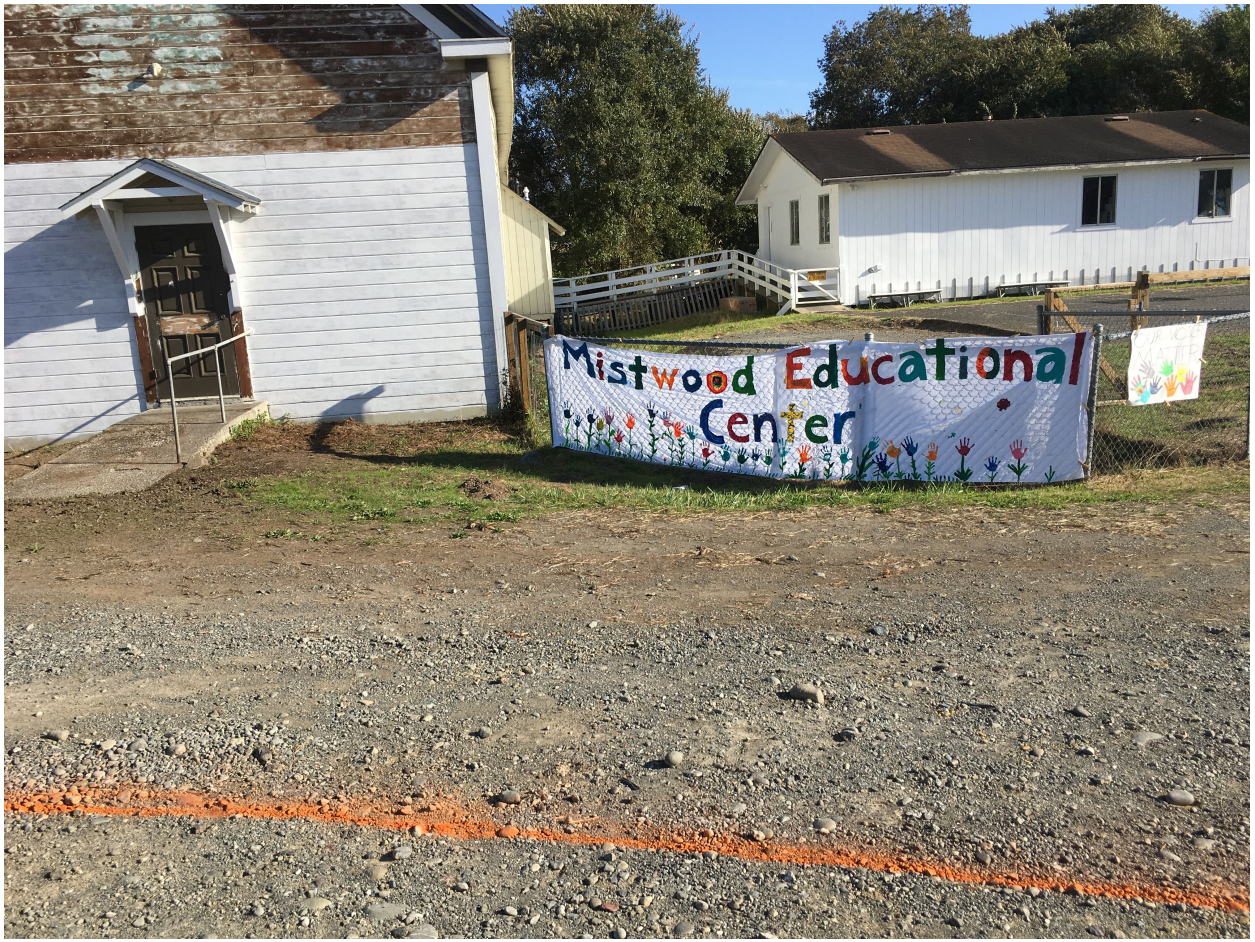
Redaction Map from City of Astoria showing 27 ft. distance between the Redaction and the School building