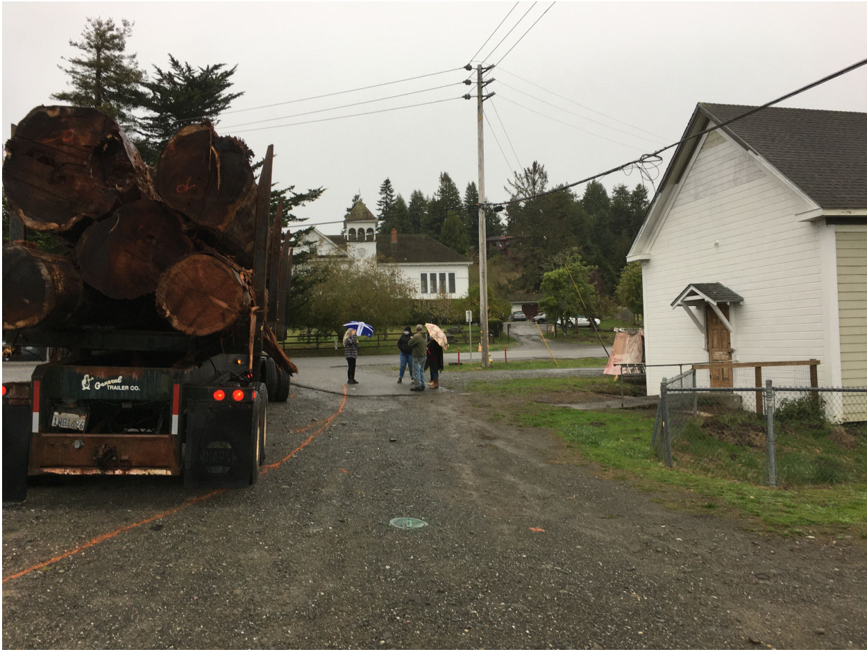
Orange line shows the approximate location of the boundary for the Boardwalk within 25 feet of the School