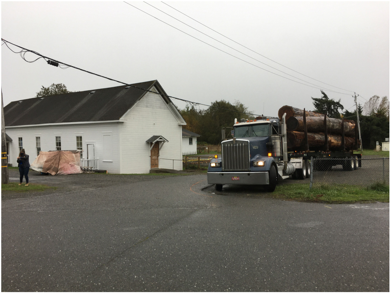
Logging Truck in front of Kenworth Truck Company building in Kenworth, Ohio