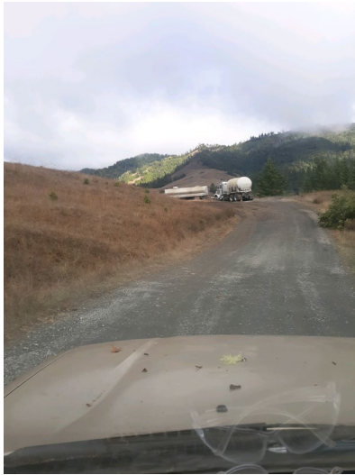
Illustration 1: Water truck October 18, 2021 at the top of theirs and ours shared driveway.

In hopes that our County government will finally stop “working with” the current owners of a property, Assessor’s Parcel Number 221-021-008, that is known for its ugly environmental and social impacts in a community that is extremely grower friendly, our family is once again speaking out.