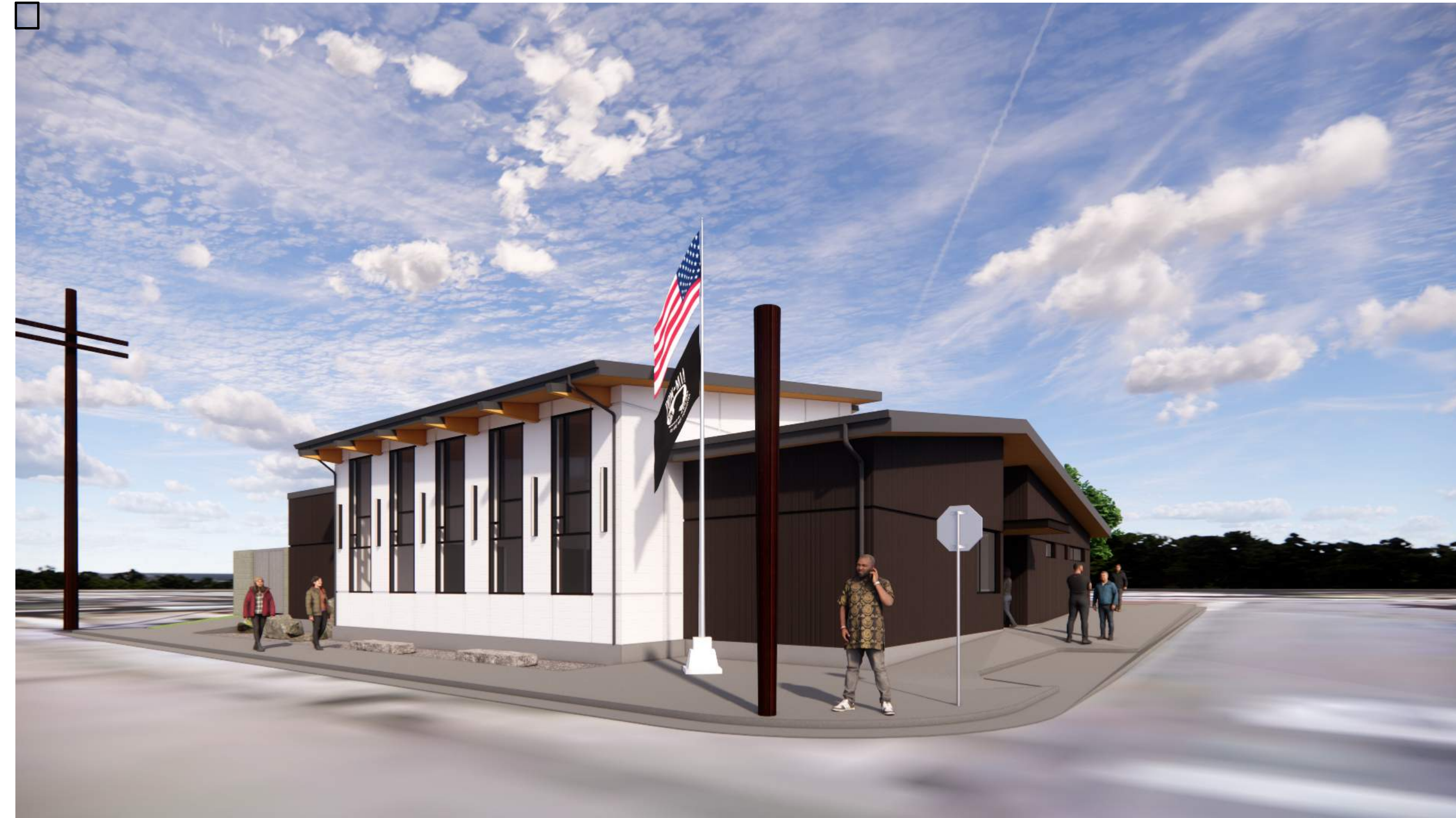
Perspective View - Intersection Southwest