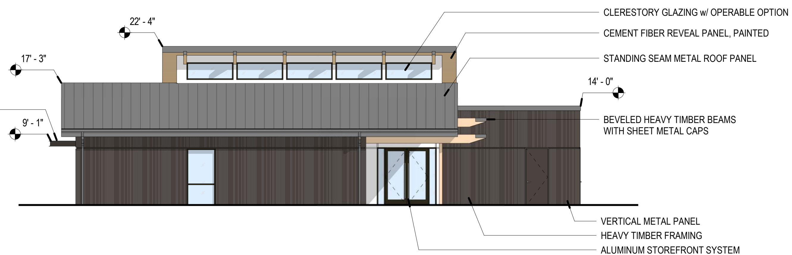
1 BUILDING ELEVATION, EAST (FRONTIER COMMUNICATIONS) 1/8" = 1'-0"