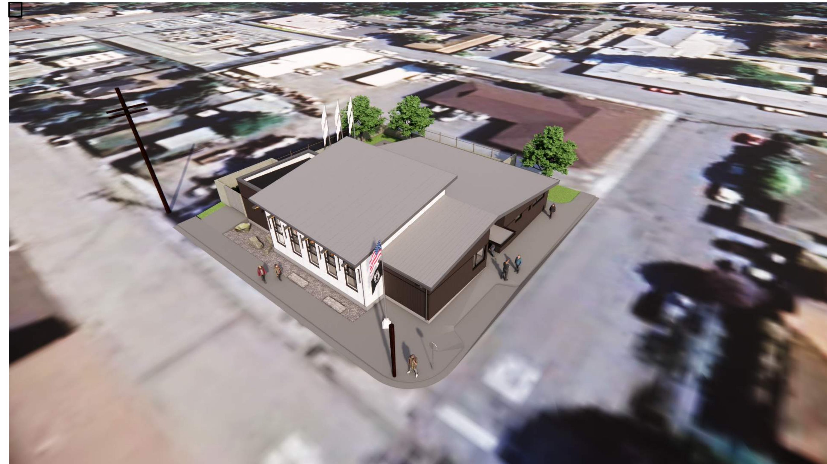
Perspective View - Overhead from Southwest