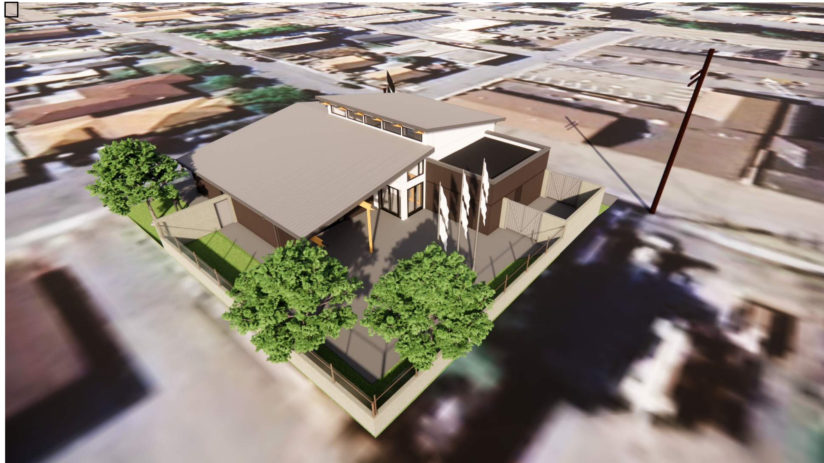
Perspective View - Overhead from Northeast