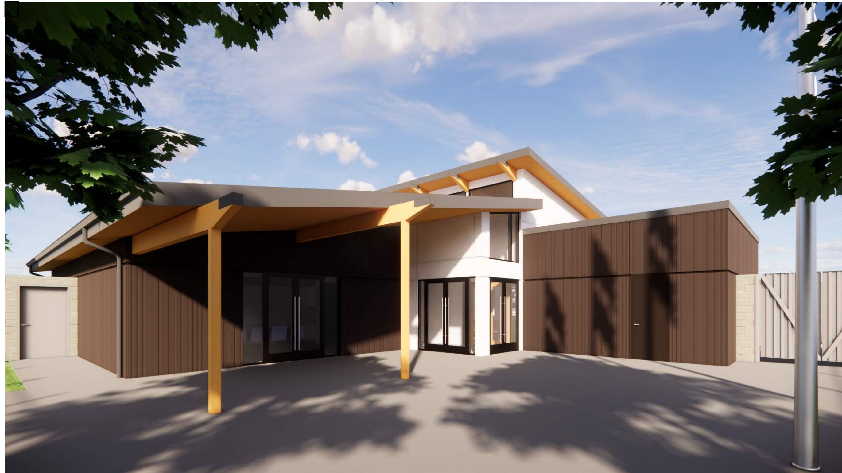
Perspective View - Patio from Northeast