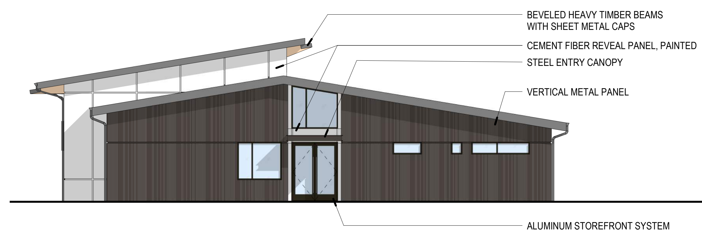
4 BUILDING ELEVATION, SOUTH (CONGER STREET) 1/8" = 1'-0"