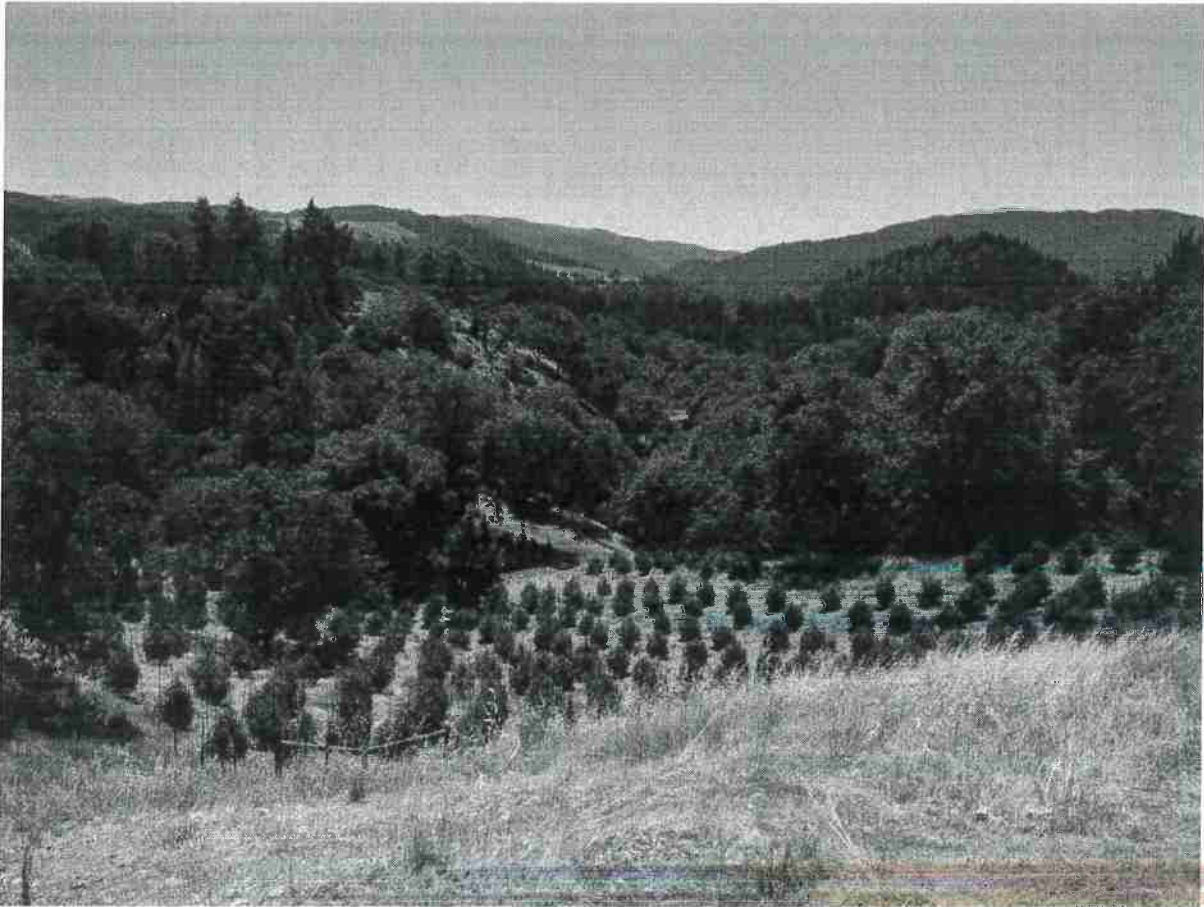
Photograph #46—Outdoor cultivation area out beyond season road where SC11 is located