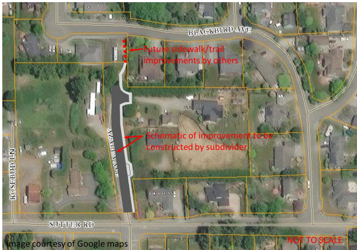
Above: conceptual design of improvements. An engineered design is required.

The sidewalk shall be extended to the north line of the subdivision to align with a future sidewalk/trail connection to Blackbird Avenue. (Added 04/30/2024)