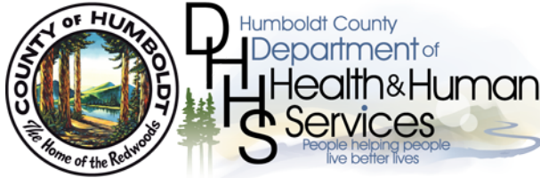
EXHIBIT G CALFRESH OUTREACH QUARTERLY PROJECT REPORT FORM 2-1-1 HUMBOLDT INFORMATION AND RESOURCE CENTER