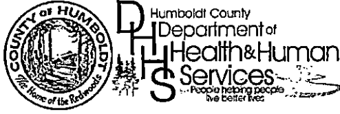
EXHIBIT G CALFRESH OUTREACH QUARTERLY PROJECT REPORT FORM REDWOOD COMMUNITY ACTION AGENCY (RCAA)