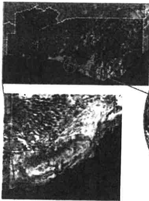
EXHIBIT A- LOCATION

2956 D STREET, EUREKA, CA ASSESSOR'S PARCEL NUMBER 010-183-007