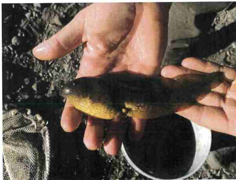
This is a photo of a Bullfrog tadpole.