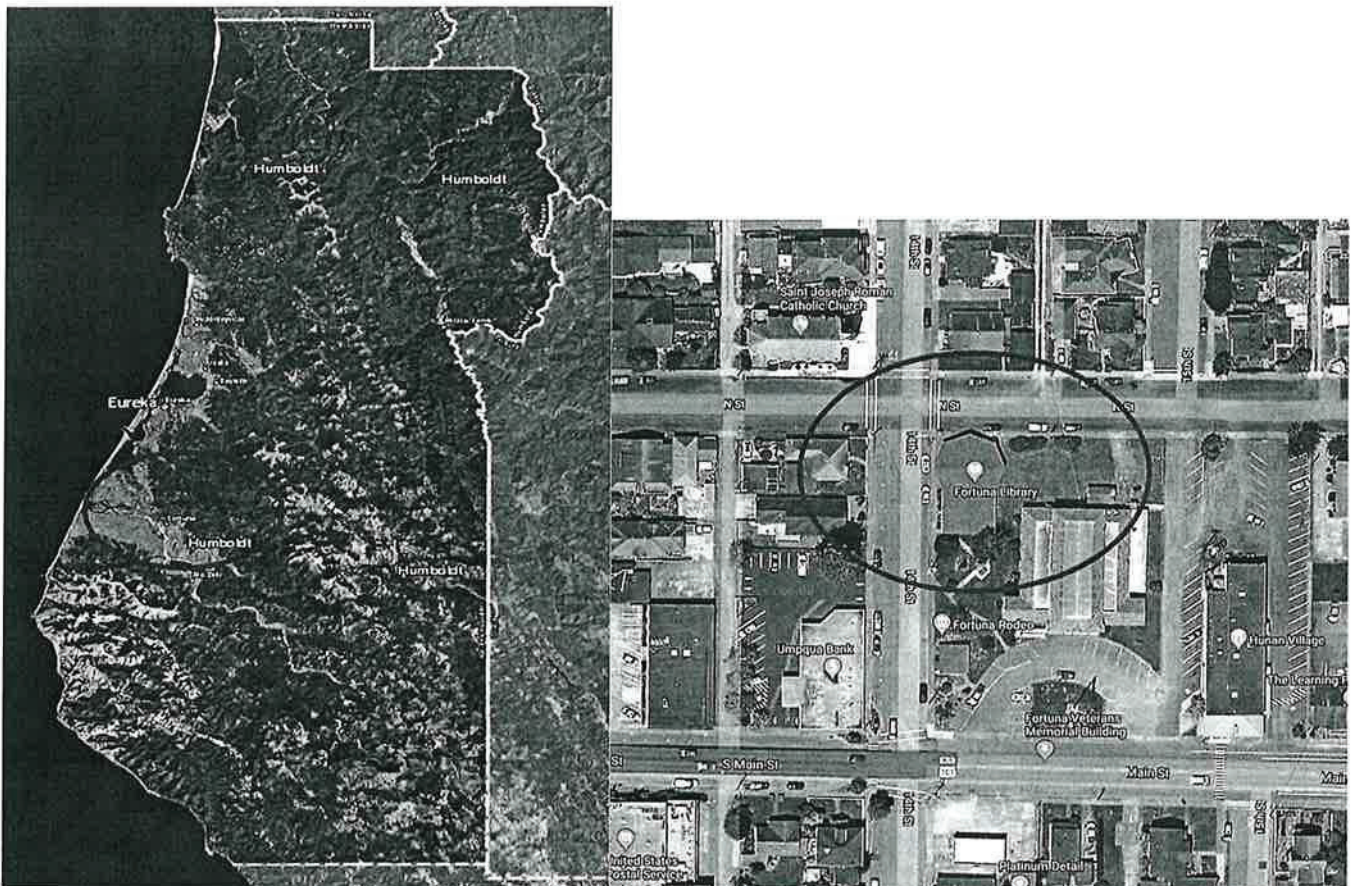
EXHIBIT A PROPERTY DESCRIPTION City of Fortuna

Leased premises at 753 Fourteenth Street, Fortuna, California 95540 (Assessors Parcel Number: 040-021-008)