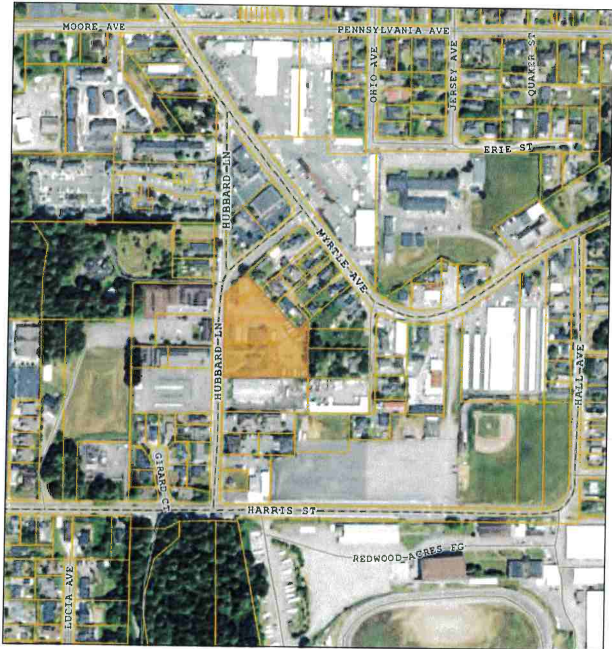
Figure 1 Project Location