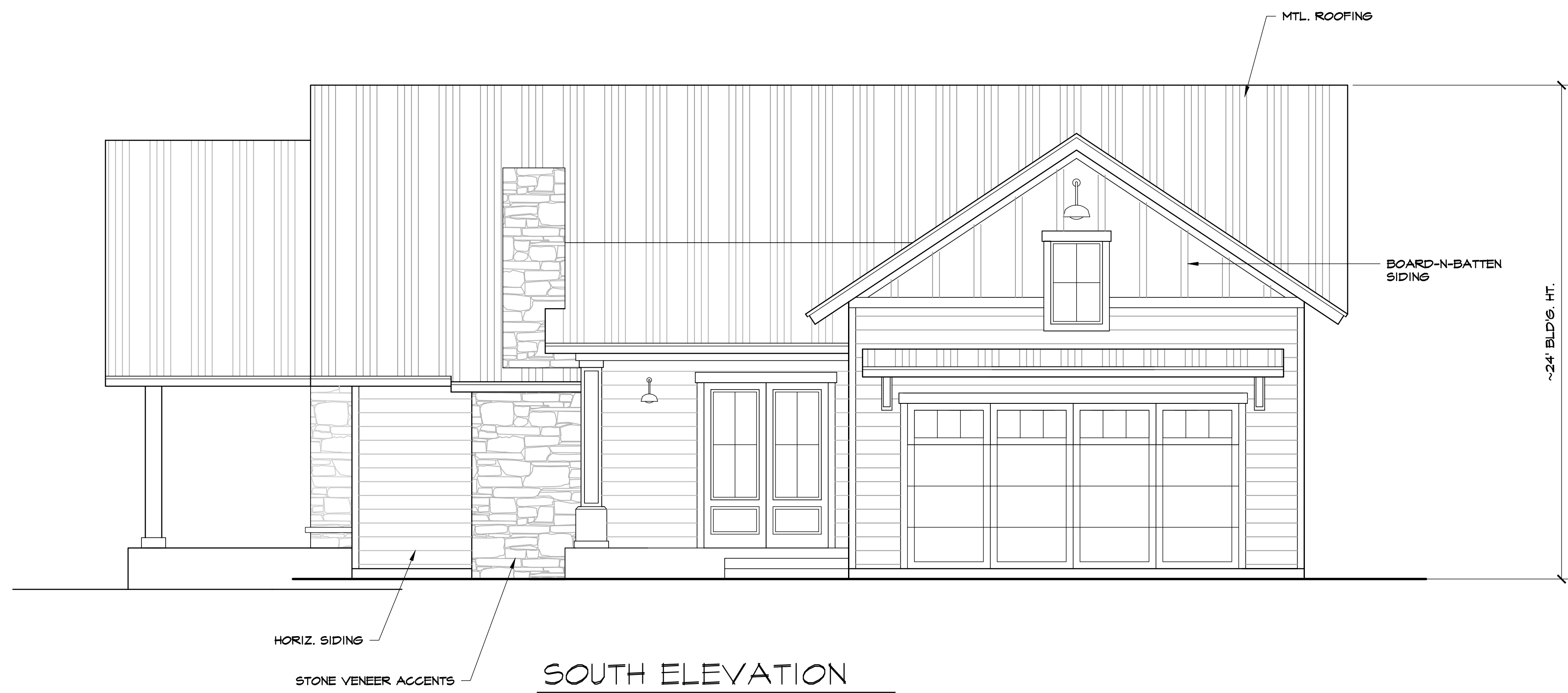
SOUTH ELEVATION 1/4"=1'-0"