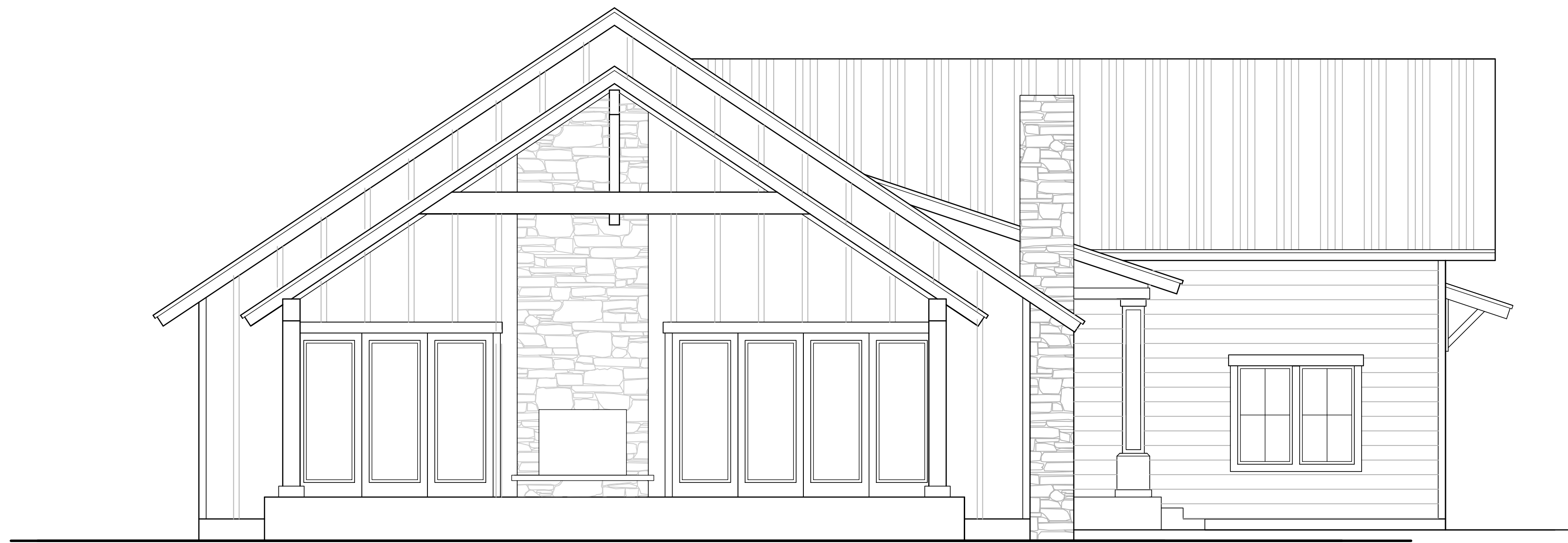
WEST ELEVATION 1/4"=1'-0"