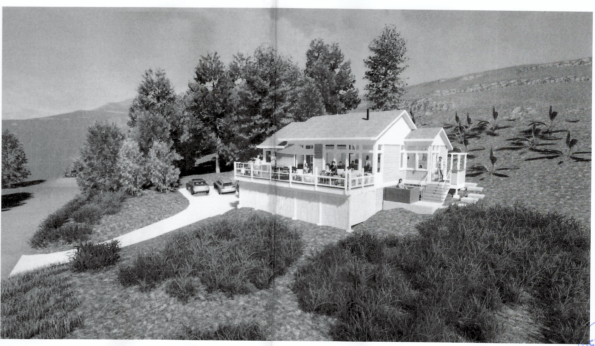
CONCEPTUAL APPROACH RENDERING