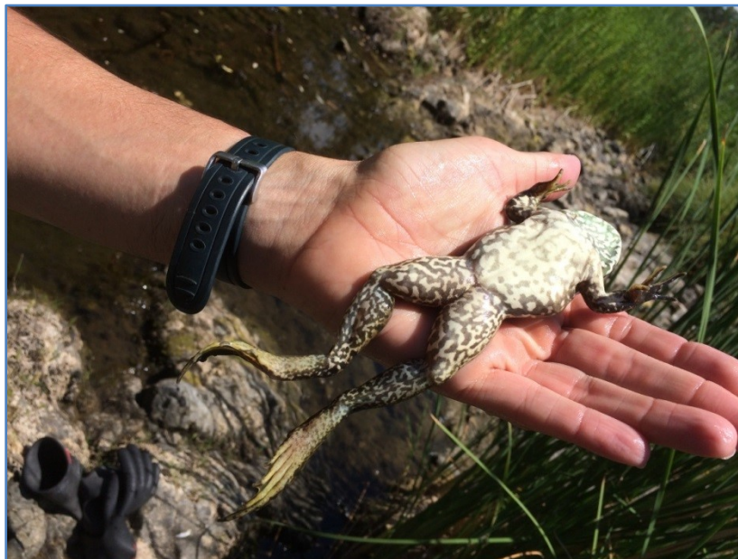
The bullfrog has somewhat distinct mottling and the underside of the bullfrogs hind legs are not shaded pink or red.