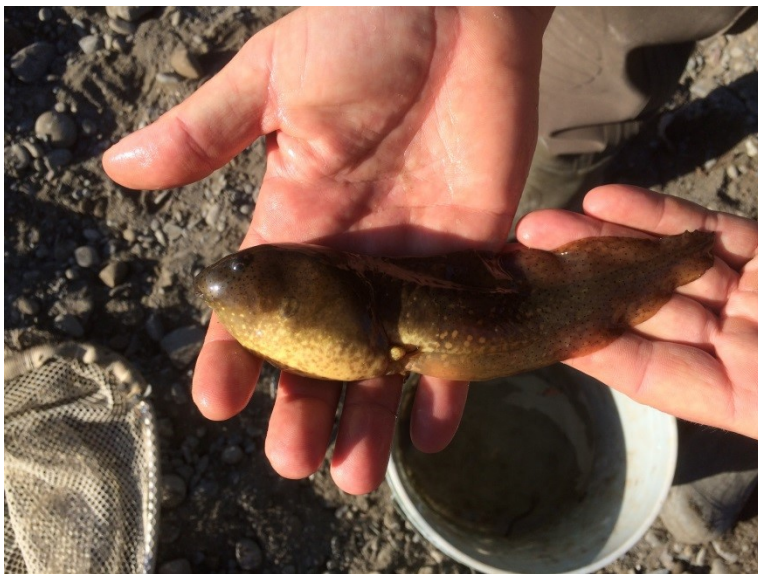
This is a photo of a Bullfrog tadpole.