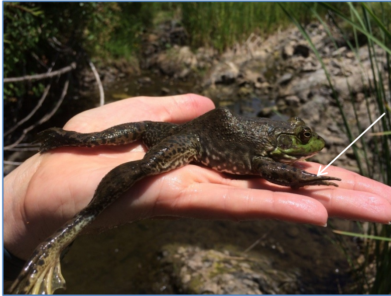
The photos shown in this Appendix demonstrate a medium sized adult bullfrog that was removed from Ten Mile Creek, Mendocino County. Note the bullfrog has a large tympanum, (circular ear drum shown with an arrow) and does not have distinct ridges along its back (dorsolateral folds).