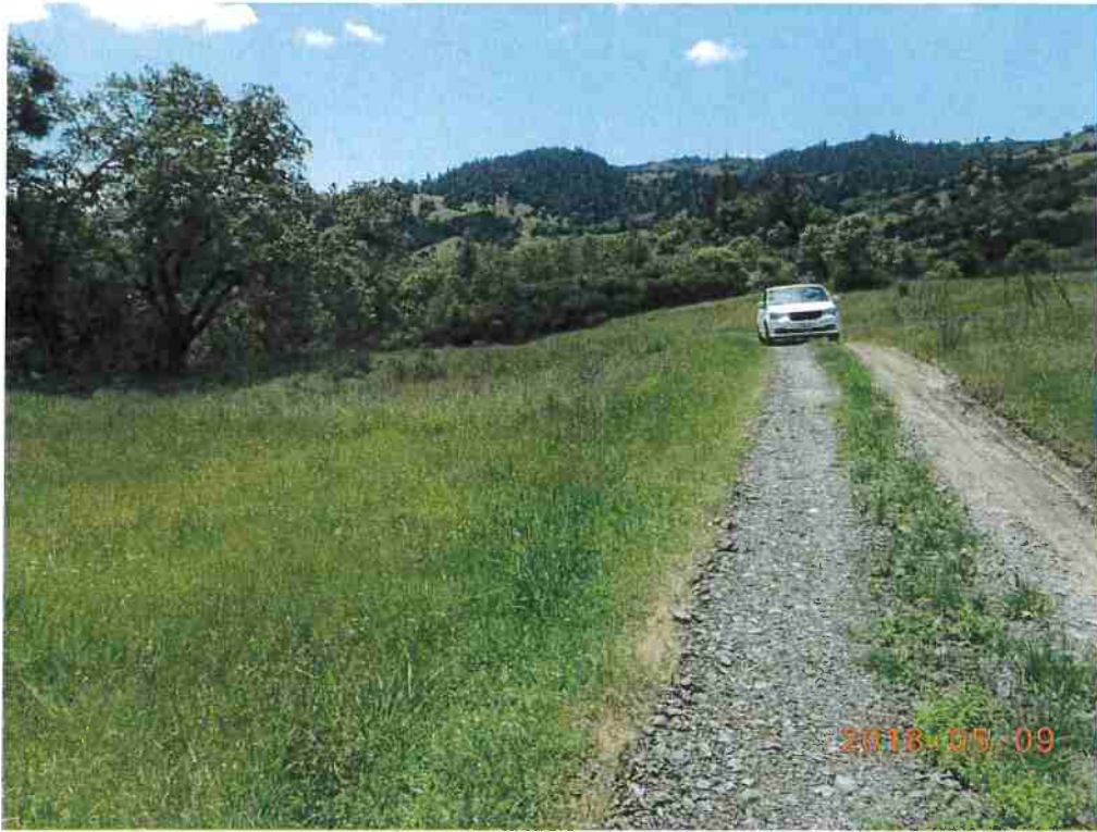
(Proposed) Cultivation Area H