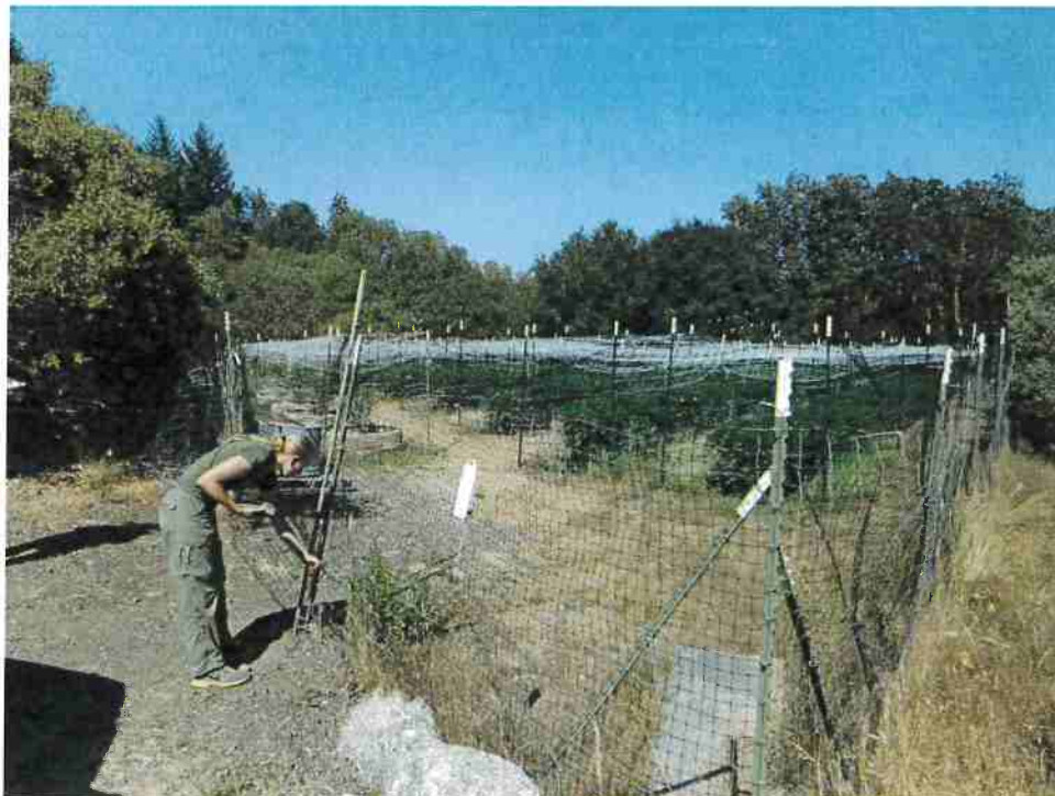
Cultivation Area D – to remain as-is