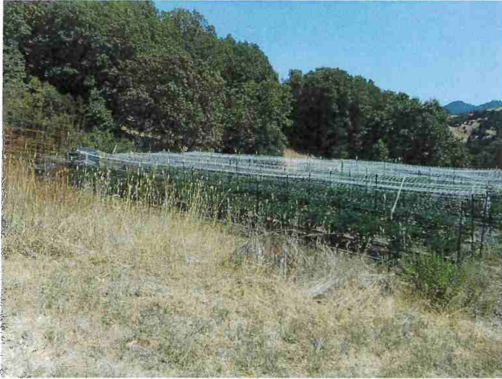
Cultivation Area F – to be removed out of riparian setbacks and restored entirely