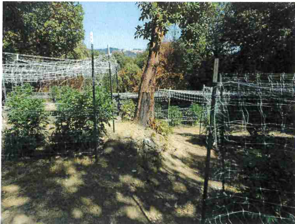
Cultivation Area B – to remain as-is