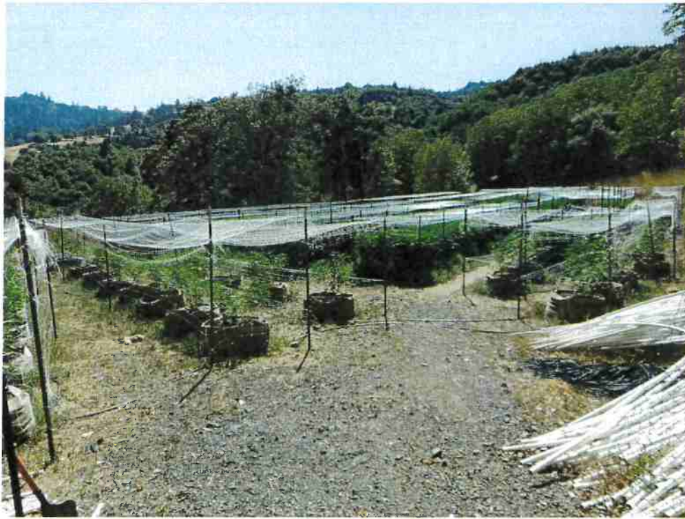
Cultivation Area G – to be altered out of 50' riparian setback