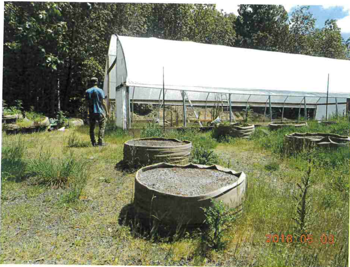
Cultivation Area A – Greenhouse proposed to be relocated