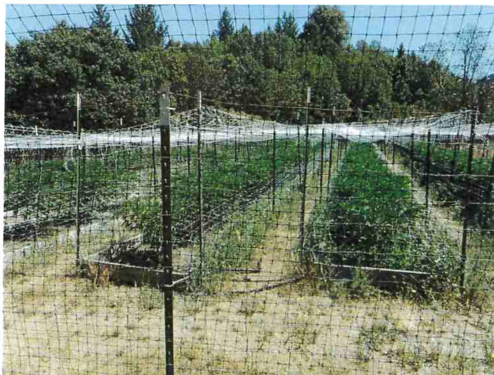
Cultivation Area C – to be reduced out of riparian setback