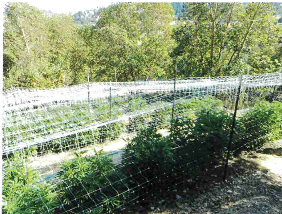
Cultivation Area E – to be removed out of riparian buffers and restored