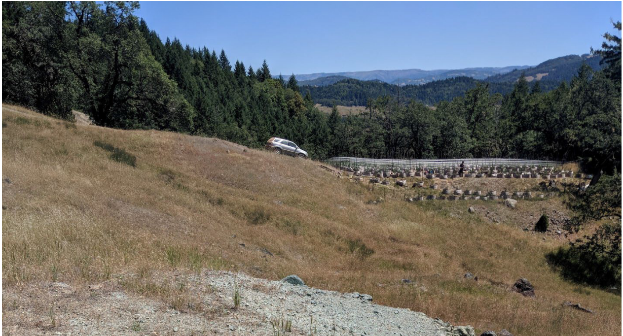
Photo 5. Site M cultivation site should be remediated and restored by planting grass. The nearby serpentine area is characterized by a blue-green tinge, and this area should be avoided.