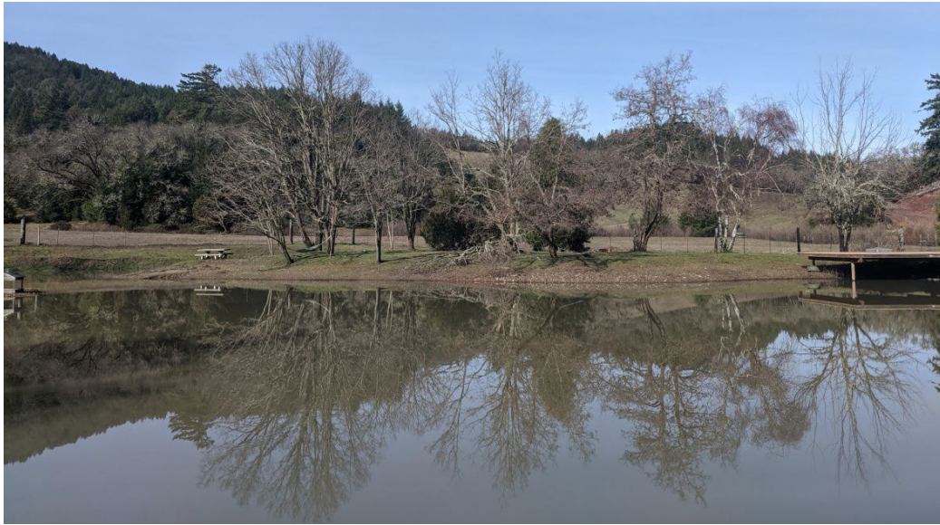
Photo 2. The pond at Site K is on-stream, and native habitat enhancement is recommended.