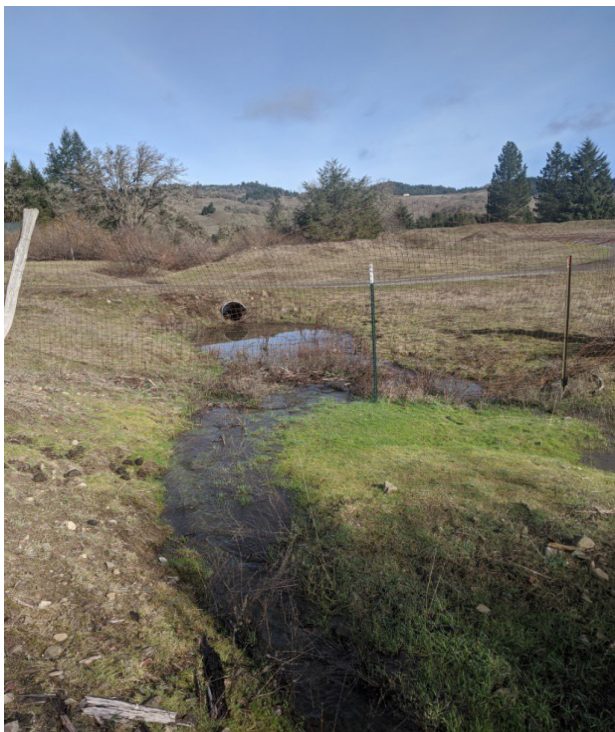
Photo 3. The outlet channel of pond k, should be rocked and revegetated with native willows.