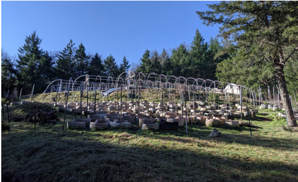
Photo 4. Site I includes greenhouses on the graded landing and outdoor cultivation on the surrounding slope. This shall be replaced with an emergency access turnaround and grass seeding sloped banks.