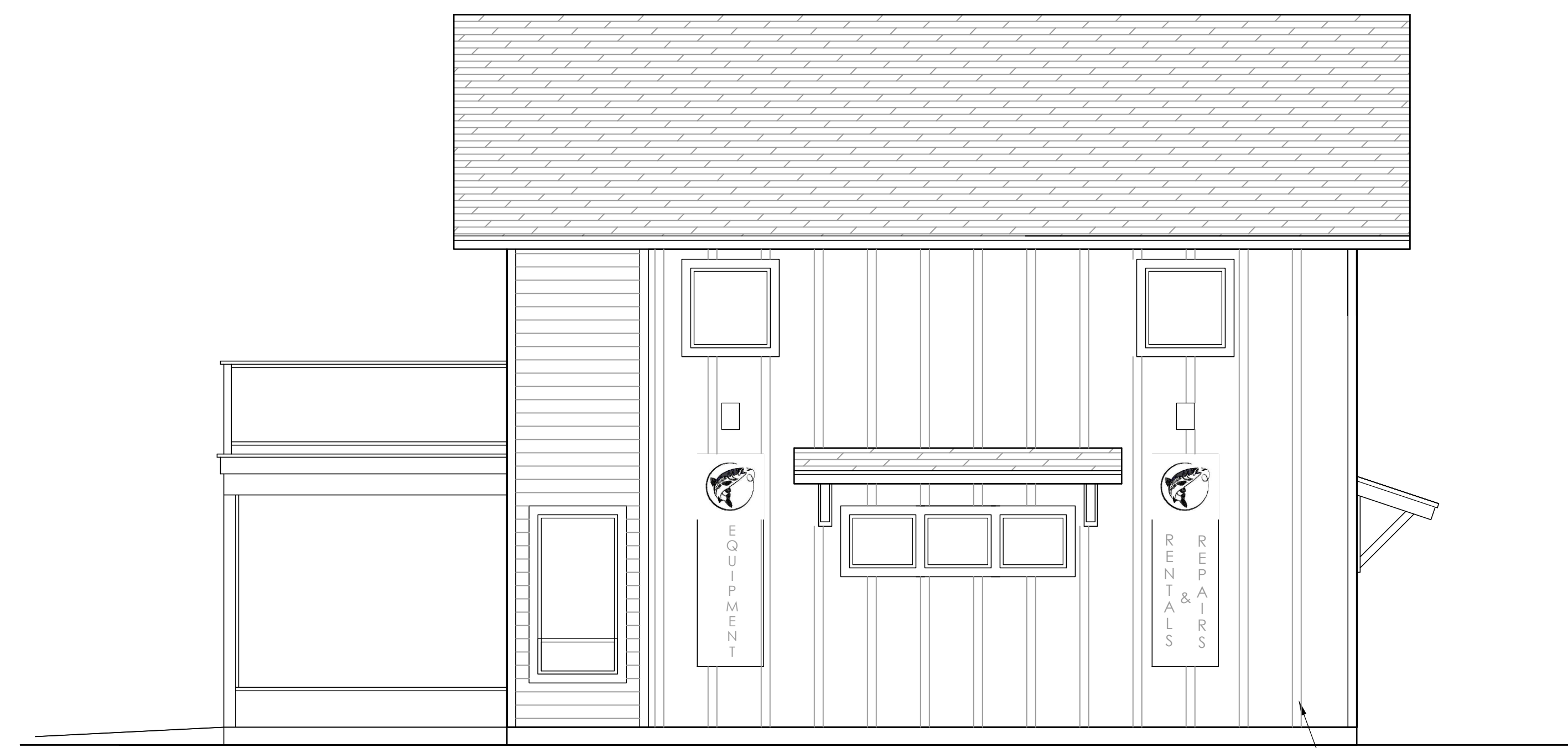
SOUTH ELEVATION 1/4"=1'-0"