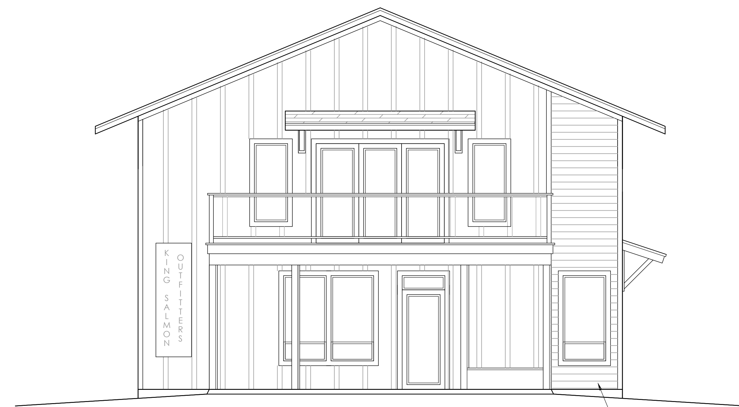
WEST ELEVATION 1/4"=1'-0"