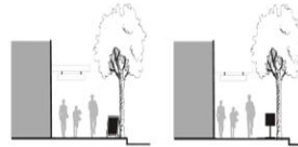
A-frame & Standing Signs