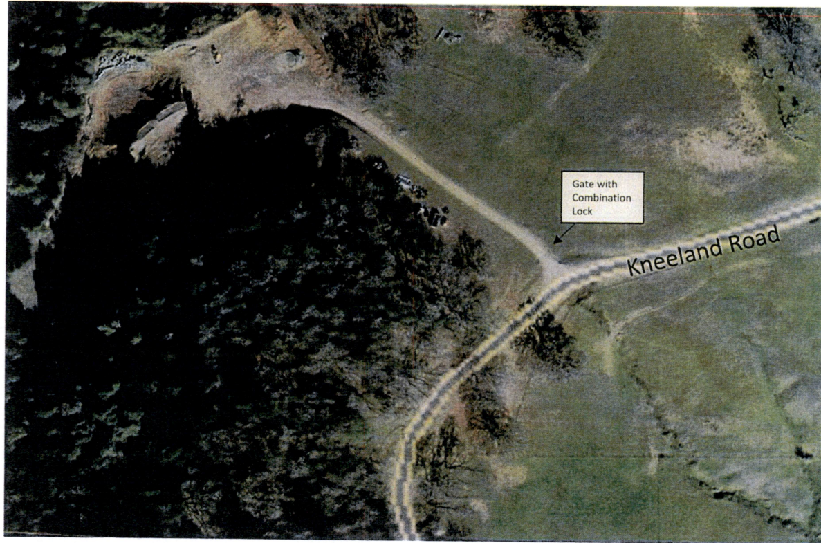
EXHIBIT B Hansen Quarry