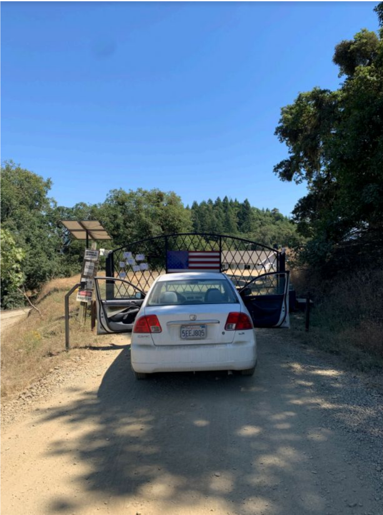
ENTRY AT INTERSECTION HOGTRAP ROAD X ISLAND MOUNTAIN ROAD