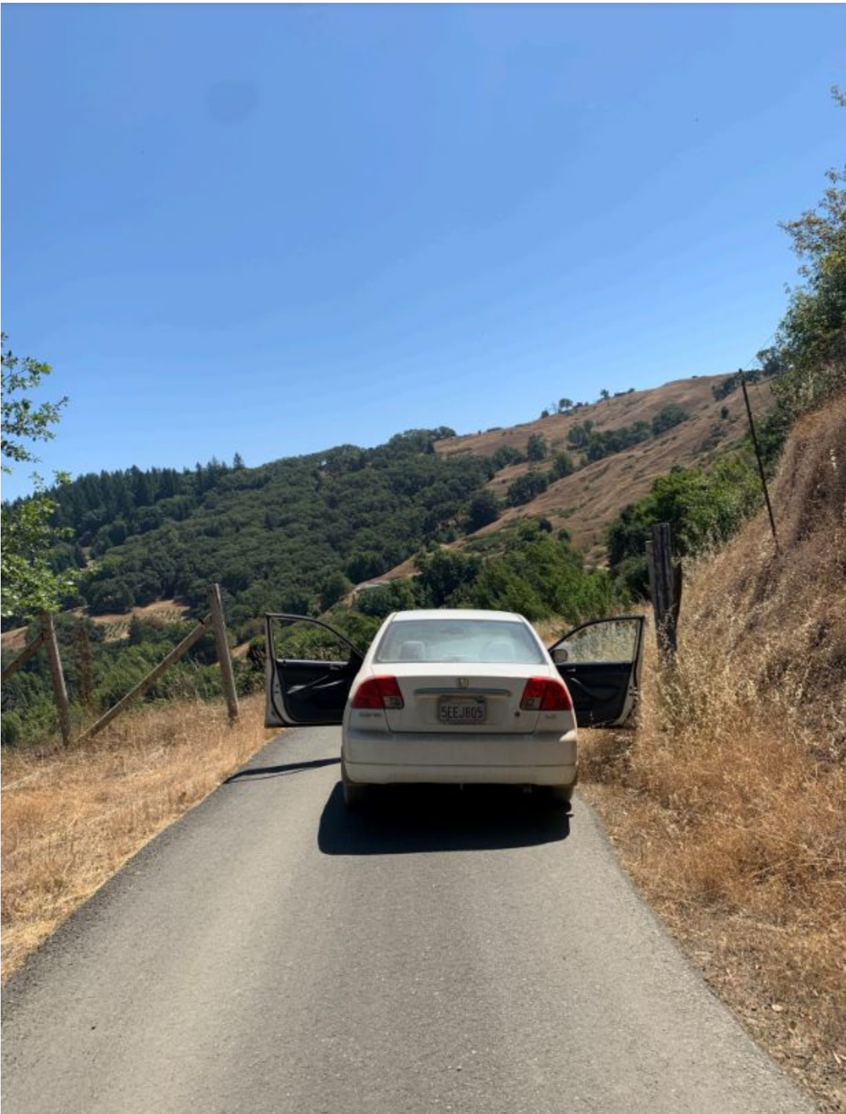
AT PARCEL ENTRY