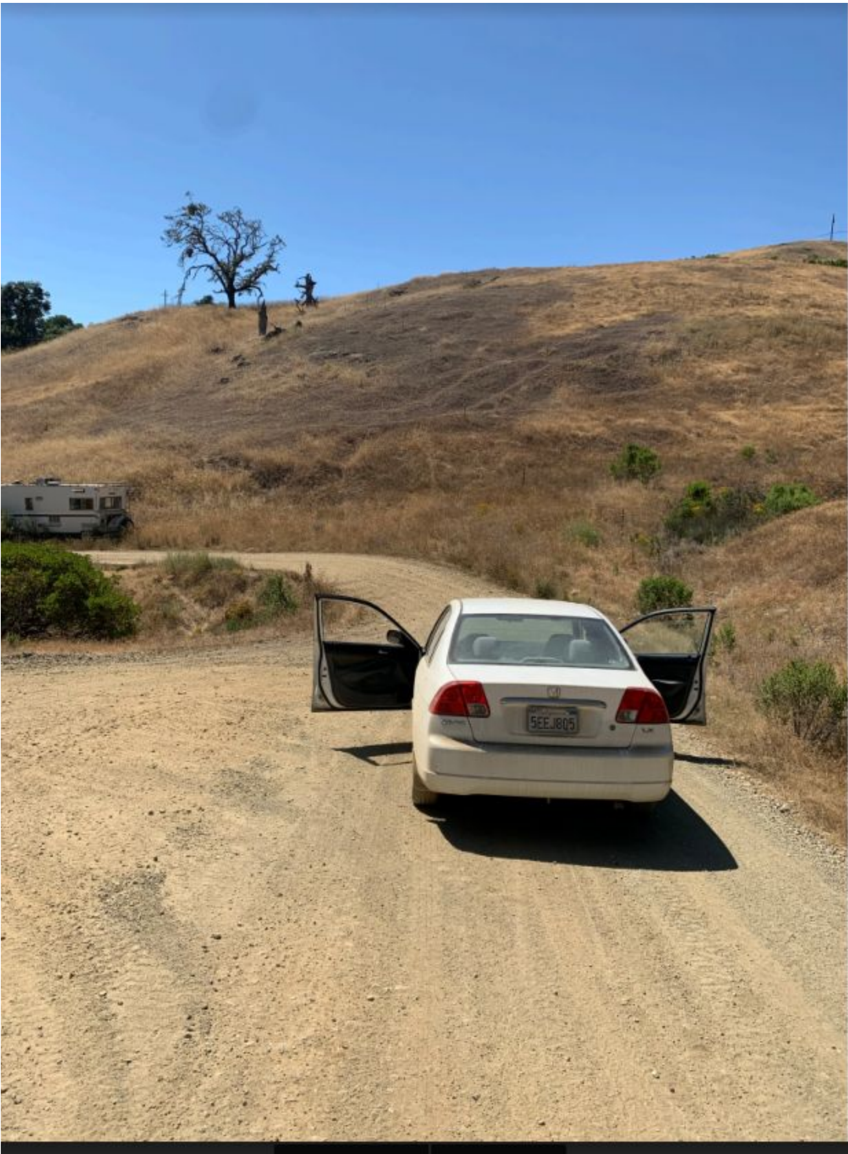
APPROX 0.3 MI ALONG ACCESS ROAD