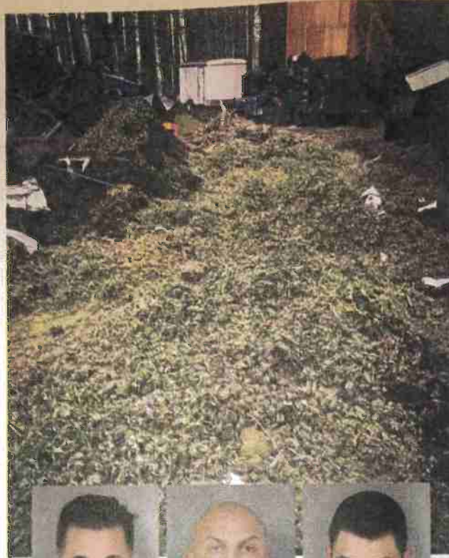
Mug shots of the three men accused in the heist plot, Brooks, Borisov and Kopankov, inset in a picture of a marijuana bud pile from the Nov. 27 bust at a property in Southern Humboldt that may be connected to the failed plan to allegedly kidnap, rob and torture a Humboldt County grower.

Both men had been released from federal custody and Brooks' detention