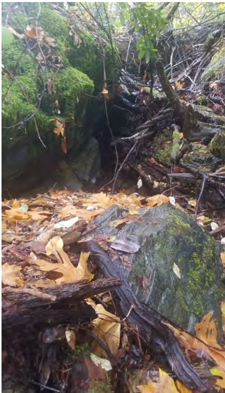
Photo 14 – Another view of downed wood within the stream channel downstream from the project area. Extensive moss on wood demonstrates that it has been there a significant amount of time. View is looking upstream towards the project area. Also note that this is a step within the stream channel similar to that shown in Photo 4 and Photo 11 above (Photo November 20, 2020).