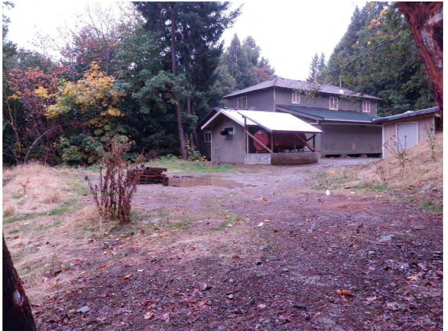
Photo 2 – Same view with ASTs removed. The site was evaluated and contaminated soils removed ( ).