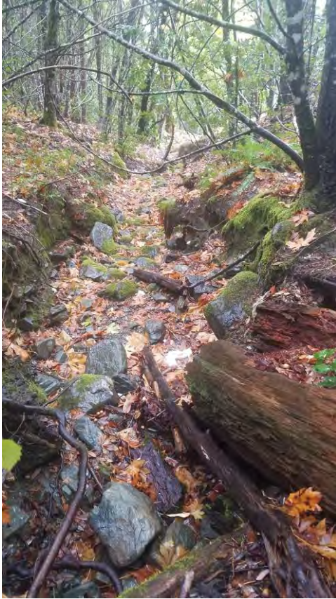
Photo 5 – View from the same location as Photo #3, looking downstream towards the subject area (Photo November 20, 2020).