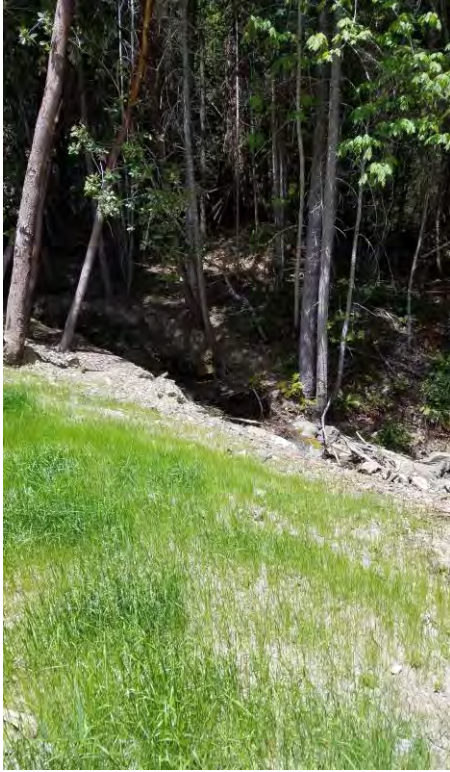
Photo 9 – The site has been seeded and straw mulched. Grass is starting to grow (Photo May 7, 2019).