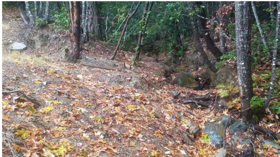
Photo 8 – View at the project site, on the right bank, looking upstream. Another view of graded area. Grading within the streamside management area tappers towards the stream (Photo November 20, 2020).