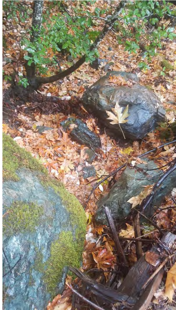
Photo 1 and Photo 2 – Photo 1 is downstream of the subject area demonstrating the rocky nature of the streambed. Photo 2 is a view looking upstream of the subject area, again demonstrating the rocky nature of the project area (Photo November 20, 2020).