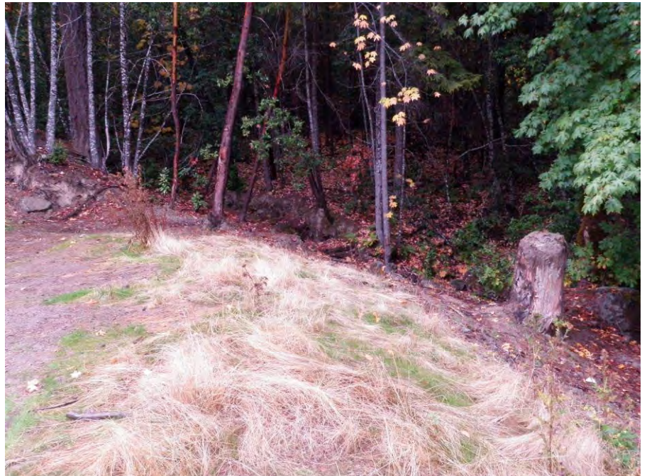
Photo 10 – View from graded area within the SMA, looking down at the stream channel. Note same trees within Photo 7 and Photo 8. Also note that streambank has been grassed over, minimizing sediment input into the stream channel (Photo Date Unknown).