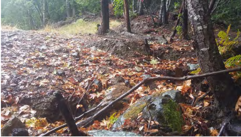
Photo 7 – View at the project site, looking towards the right bank. Note the remaining alders and native vegetation. In the background are smaller diameter trees, some with sediment build up around the base of some of the trees in the background. Also note a cleared behind the trees and in the upper left-hand side of the photo (Photo November 20, 2020).