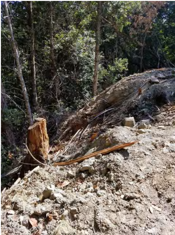
Photo 12 – View of the edge of the graded pad as it encroaches upon the stream channel. Stream channel is approximately 10 feet below the edge of the graded pad. View is looking down stream (Photo Date Unknown).