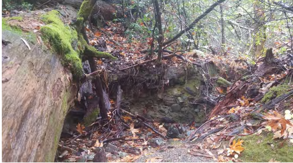
Photo 13 - Downed wood exists within the channel directly below the project area. View is looking upstream towards the project area. Also noted is a step within the stream channel similar to that shown in Photo 4 (Photo November 20, 2020).