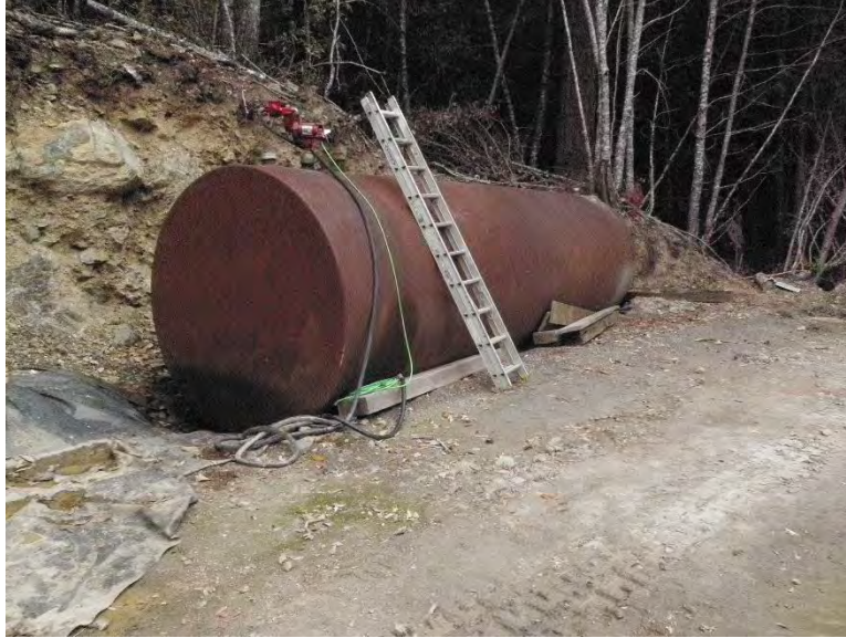
Photo 3 and Photo 4 - Photo 3 (above) is a picture of a large AST within the SMA. View is looking towards the stream (June 15, 2017). Photo 4 (below) is the same view with large AST removed. Note 5-gallon bucket which was part of soil contamination investigations. Also note streamside alder trees on the right half of photo (August 3, 2017).