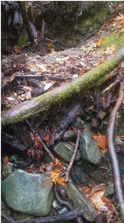
Photo 4 – Further upstream from Photo 3 the stream naturally takes a step up (Photo November 20, 2020).