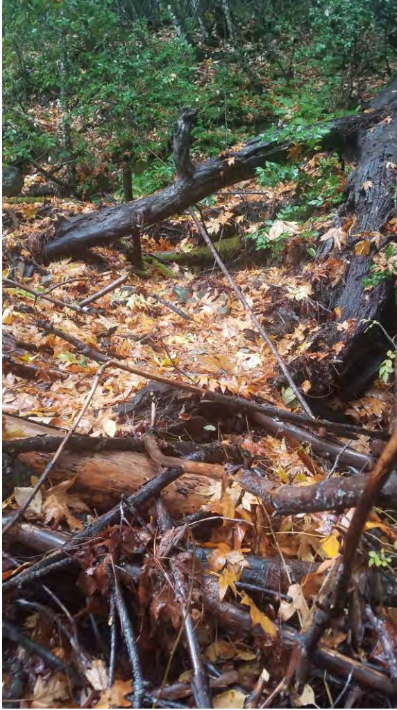
Photo 15 – Another view of downed wood within the stream channel downstream from the project area. Stream channel is duff covered. View is looking downstream from Photo 12 (Photo November 20, 2020).