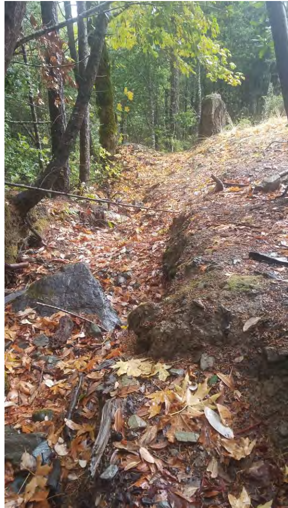
Photo 6 – Close-up view of the subject area looking downstream. Note the open area on the right side of the photo is the project site (Photo November 20, 2020).