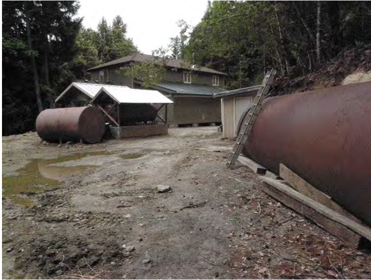
Photo 1 – View from the edge of the graded flat, within the streamside management area. Previous tenants on the property had several aboveground storage tanks, not all within secondary containment. These tanks were instrumental in getting a NOV for this property (June 15, 2017).